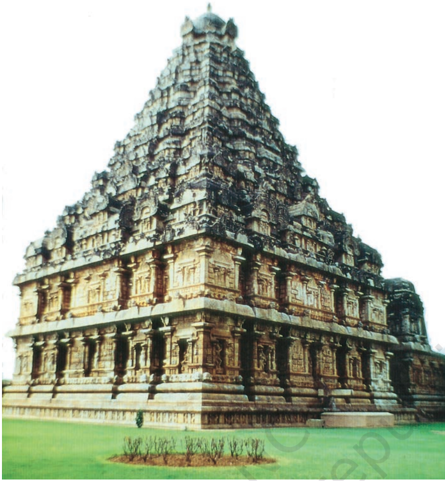
Fig. 3 The temple at Gangaikondacholapuram. Notice the way in which the roof tapers. Also look at the elaborate stone sculptures used to decorate the outer walls.

Chola temples often became the nuclei of settlements which grew around them. These were centres of craft production. Temples were also endowed with land by rulers as well as by others. The produce of this land went into maintaining all the specialists who worked at the temple and very often lived near it – priests, garland makers, cooks, sweepers, musicians, dancers, etc. In other words, temples were not only places of worship; they were the centres of economic, social and cultural life.