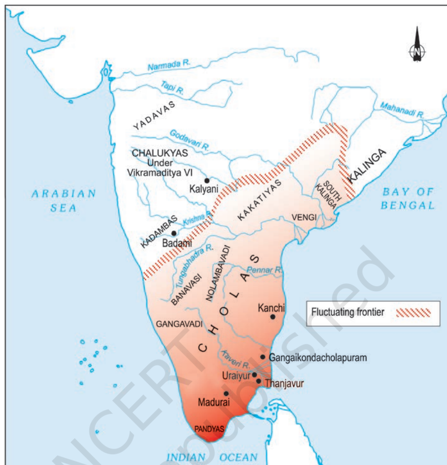
Map 2 The Chola kingdom and its neighbours.

The successors of Vijayalaya conquered neighbouring regions and the kingdom grew in size and power. The Pandyan and the Pallava territories to the south and north were made part of this kingdom. Rajaraja I, considered the most powerful Chola ruler, became king in 985 and expanded control over most of these areas. He also reorganised the administration of the empire. Rajaraja's son Rajendra I continued his policies and even invaded the Ganga valley, Sri Lanka and countries of Southeast Asia, developing a navy for these expeditions.