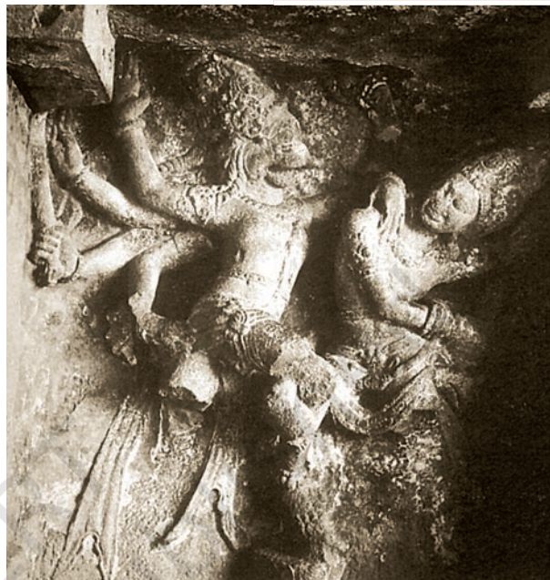
Fig. 1 Wall relief from Cave 15, Ellora, showing Vishnu as Narasimha, the man-lion. It is a work of the Rashtrakuta period.

Many of these new kings adopted high-sounding titles such as maharaja-adhiraja (great king, overlord of kings), tribhuvana-chakravartin (lord of the three worlds) and so on. However, in spite of such claims,