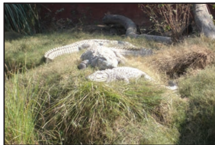
Fig. 6.12 : Crocodiles