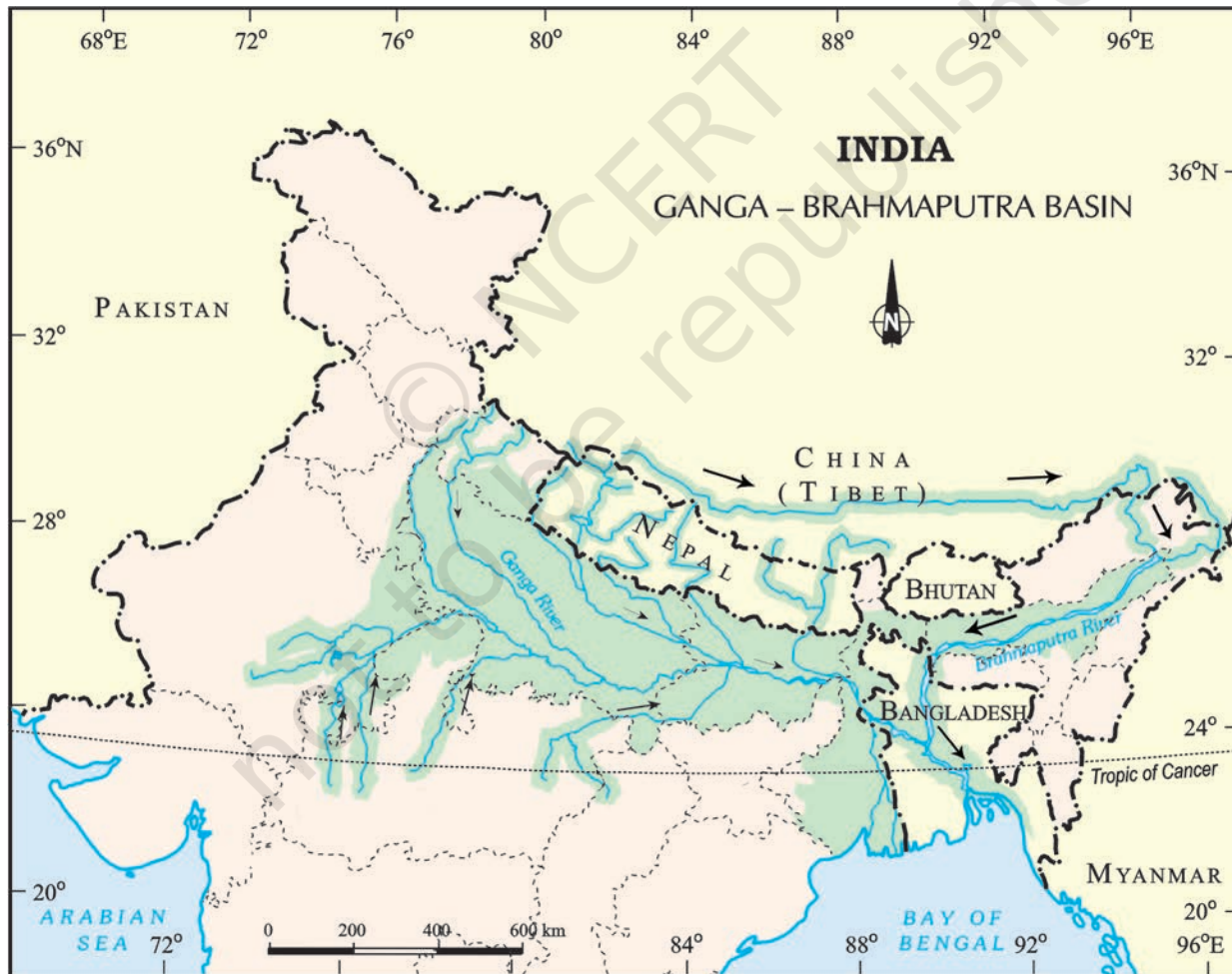
Fig. 6.8: Ganga-Brahmaputra Basin

The plains of the Ganga and the Brahmaputra, the mountains and the foothills of the