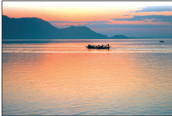
Fig. 6.7 Brahmaputra river

The tributaries of rivers Ganga and Brahmaputra together form the Ganga-Brahmaputra basin in the Indian subcontinent (Fig. 6.8). The basin lies in the sub-tropical region that is situated between 10°N to 30°N latitudes. The tributaries of the River Ganga like the Ghaghra, the Son, the Chambal, the Gandak, the Kosi and the tributaries of Brahmaputra drain it. Look at the atlas and find names of some tributaries of the River Brahmaputra.