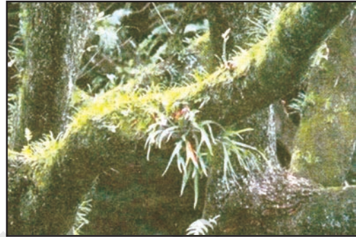
Fig. 6.3 : The Amazon Forest

As it rains heavily in this region, thick forests grow (Fig. 6.3). The forests are in fact so thick that the dense “roof” created by leaves and branches does not allow the sunlight to reach the ground. The ground remains dark and damp. Only shade tolerant vegetation may grow here. Orchids, bromeliads grow as plant parasites.