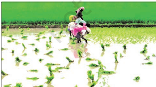
Fig. 6.9 : Paddy Cultivation

The vegetation cover of the area varies according to the type of landforms. In the Ganga and Brahmaputra plain tropical deciduous trees grow, along with teak, sal and peepal. Thick bamboo groves are common in the Brahmaputra plain. The delta area is covered with the