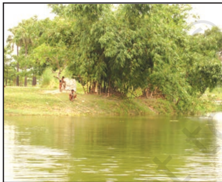
A clean lake

Binod is a fisherman living in the Matwali Maun village of Bihar. He is a happy man today. With the efforts of the fellow fishermen – Ravindar, Kishore, Rajiv and others, he cleaned the maun or the ox-bow lake to cultivate different varieties of fish. The local weed (vallineria, hydrilla) that grows in the lake is the food of the fish. The land around the lake is fertile. He sows crops such as paddy, maize and pulses in these fields. The buffalo is used to plough the land. The community is satisfied. There is enough fish catch from the river – enough fish to eat and enough fish