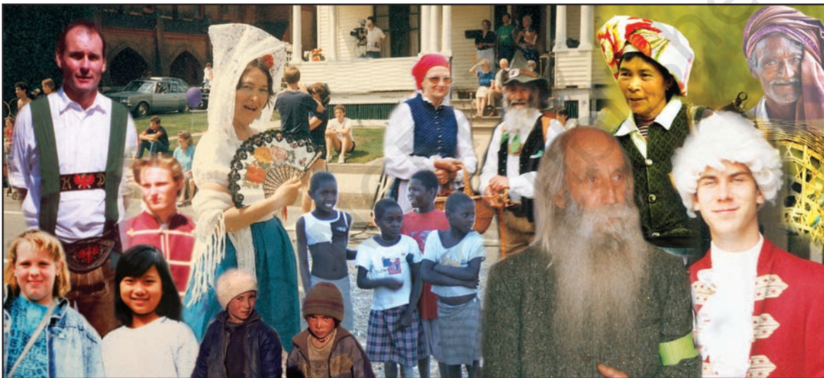
Fig. 6.1: People from various parts of the world

Renuka was excited. Shrikant Uncle was home after a gap of nearly four months. He was a wildlife photographer and travelled widely. Renuka's interest in wildlife and forests began at an early age, when her uncle introduced her to books on nature. Pictures of distant lands and people, who lived there, always fascinated her.