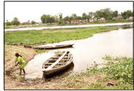
A Polluted Lake

to sell in the market. They have even begun supply to the neighbouring town. The community is living in harmony with nature. As long as the pollutants from nearby towns do not find their way into the lake waters, the fish cultivation will not face any threat.