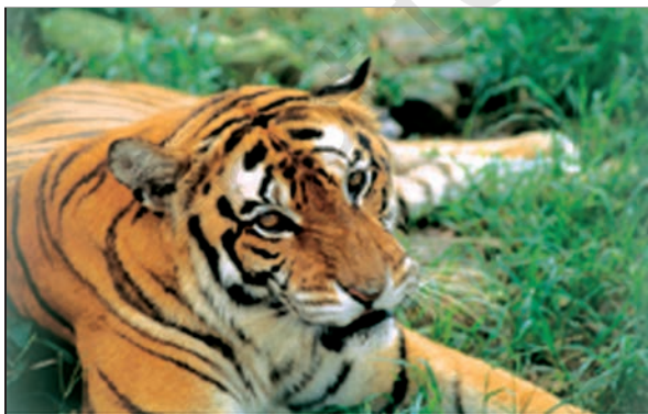
Fig. 6.14: Tiger in Manas Wildlife sanctuary

All the four ways of transport are well developed in the Ganga-Brahmaputra basin. In the plain areas the roadways and railways transport the people from one place to another. The waterways, is an effective means of transport particularly along the rivers. Kolkata is an important port on the River Hooghly. The plain area also has a large number of airports.