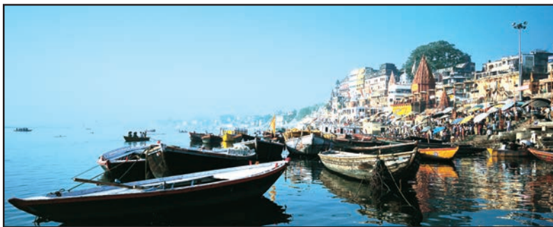
Fig. 6.13: Varanasi along the River Ganga

The Ganga-Brahmaputra plain has several big towns and cities. The cities of Allahabad, Kanpur, Varanasi, Lucknow, Patna and Kolkata all with the population of more than ten lakhs are located along the River Ganga (Fig. 6.13). The wastewater from these towns