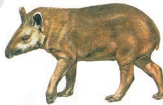
Fig. 6.5 : Tapir

The rainforest is rich in fauna. Birds such as toucans (Fig. 6.4), humming birds, macaw with their brilliantly coloured plumage, oversized bills for eating make them different from birds we commonly see in India. These birds also make loud sounds in the forests. Animals like monkeys, sloth and ant-eating tapirs are found here (Fig. 6.5). Various species of reptiles and snakes also thrive in these jungles. Crocodiles, snakes, pythons abound. Anaconda and boa constrictor are some of the species. Besides, the basin is home to thousands of species of insects. Several species of fishes including the flesh-eating Piranha fish is also found in the river. This basin is thus extraordinarily rich in the variety of life found there.