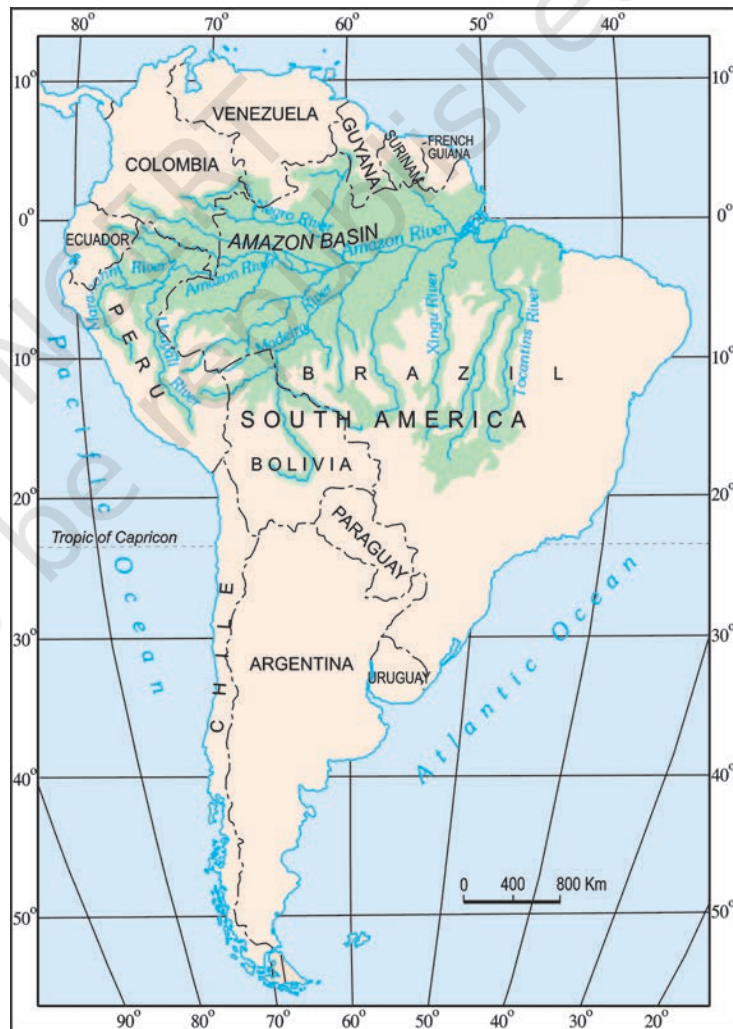
Fig. 6.2: The Amazon Basin in South America

Name the countries of the basin through which the equator passes.