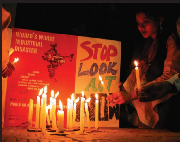
The struggle for justice goes on...