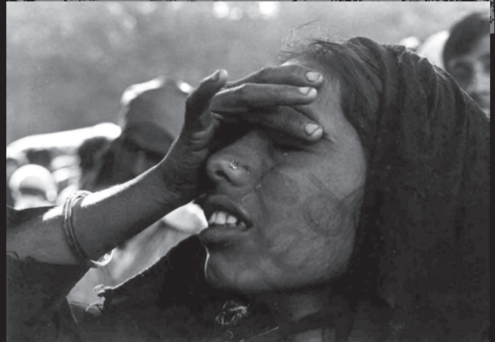
The next morning