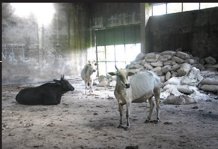
Bags of chemicals lie strewn around the UC plant

UC stopped its operations, but left behind tons of toxic chemicals. These have seeped into the ground, contaminating water. Dow Chemical, the company who now owns the plant, refuses to take responsibility for clean up.