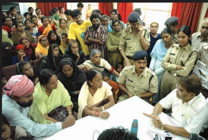
Gas victims with the Gas Relief Minister

Despite the overwhelming evidence pointing to UC as responsible for the disaster, it refused to accept responsibility.