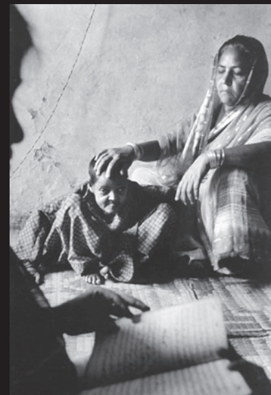
A child severely affected by the gas

Most of those exposed to the poison gas came from poor, working-class families, of which nearly 50,000 people are today too sick to work. Among those who survived, many developed severe respiratory disorders, eye problems and other disorders. Children developed peculiar abnormalities, like the girl in the photo.