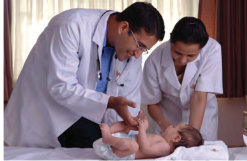
Most babies do not get basic healthcare

The problem does not end with Infant Mortality Rate. The last column of table 1.4 shows that about half of the children aged 14-15 in Bihar are not attending school beyond Class 8. This means that if you went to school in Bihar nearly half of your elementary class friends would be missing. Those who could have been in school are not there! If this had happened to you, you would not be able to read what you are reading now.