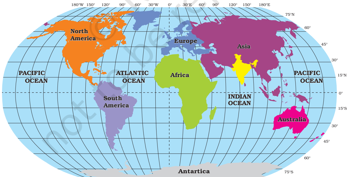
Figure 1.1 : India in the World

The land mass of India has an area of 3.28 million square km. India's total area accounts for about 2.4 per cent of the total geographical