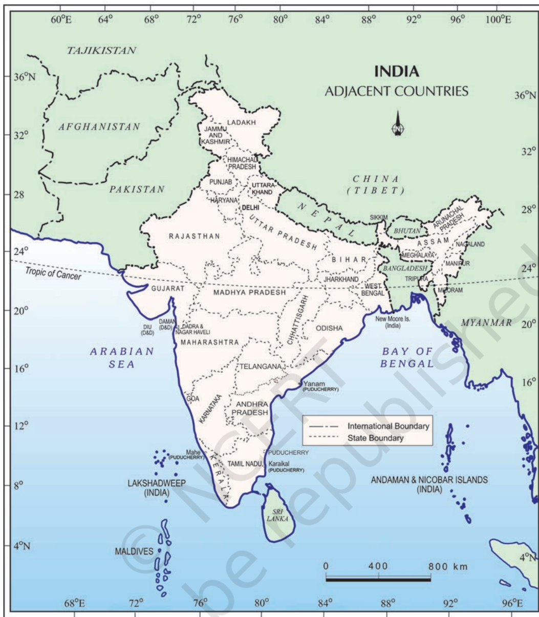
Figure 1.5 : India and Adjacent Countries

Sri Lanka and Maldives, Sri Lanka is separated from India by a narrow channel of sea formed by the Palk Strait and the Gulf of Mannar, while Maldives Islands are situated to the south of the Lakshadweep Islands.