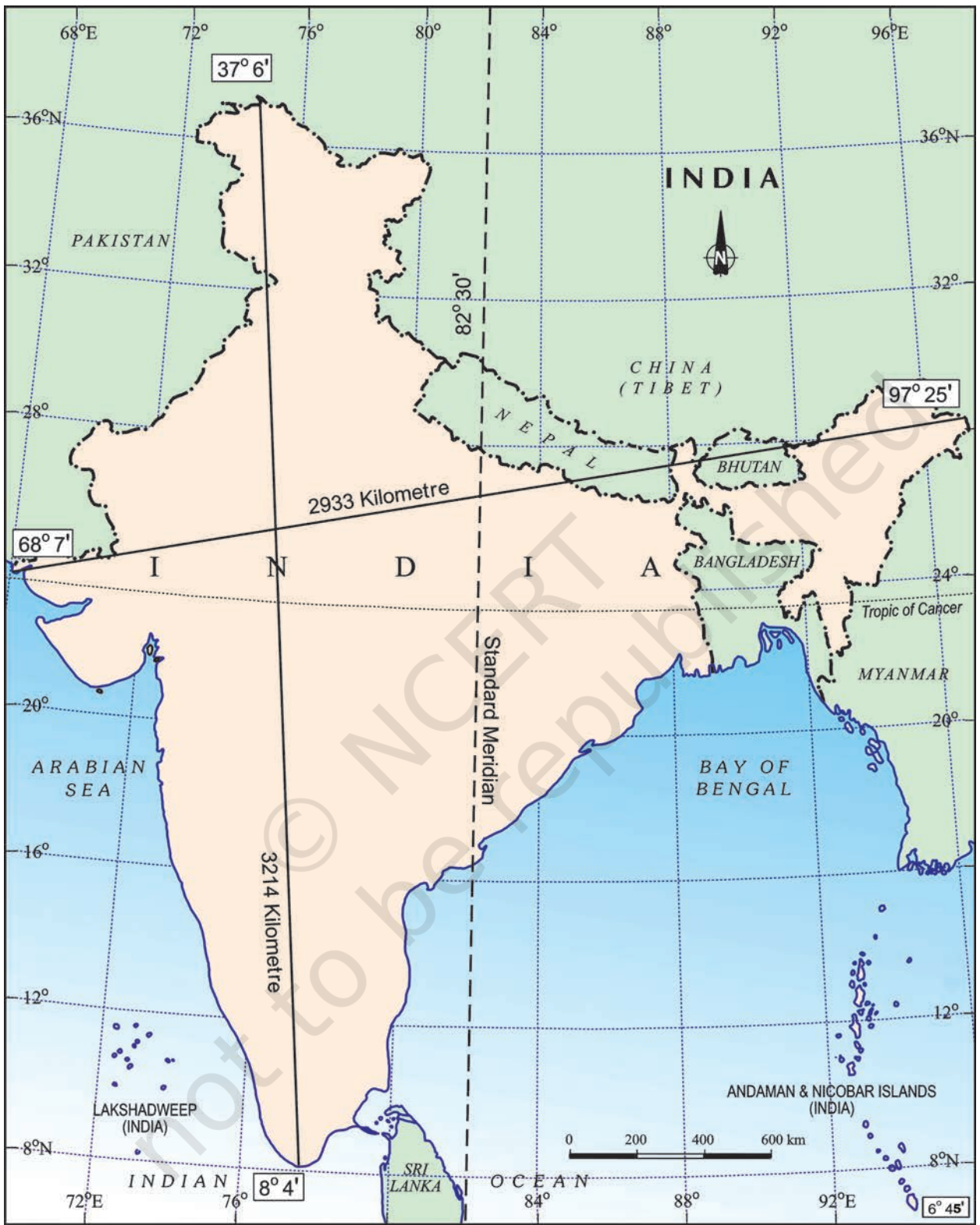
Figure 1.3 : India : Extent and Standard Meridian