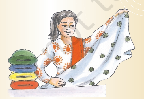
Shopkeepers sell things we use.