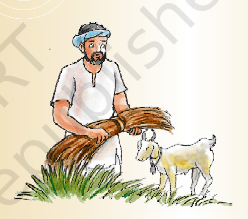
Farmers grow food and keep animals.