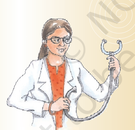
Doctors look after the ill.