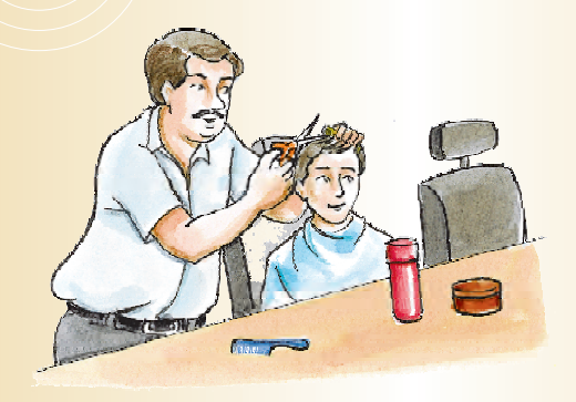
Barbers trim our hair.