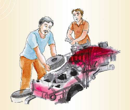
Mechanics repair machines.