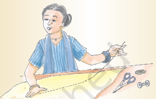
Tailors stitch clothes.