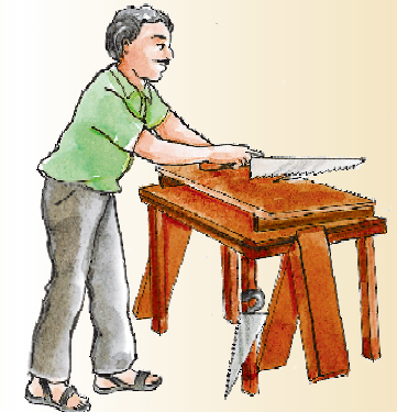
Carpenters make tables and chairs.

Look at the people around you. They do different kinds of work. They help each other in various ways.