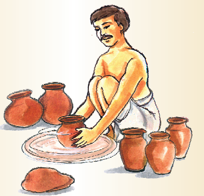
Potters make pots.