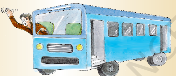
Drivers drive buses, tractors and other vehicles.